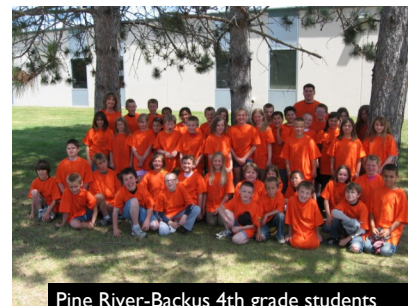
Pine River-Backus 4th grade students who completed Keep A Clear Mind

parents can help educate their child on substance abuse and prevention. 398 Pine River-Backus students received the curriculum and over 300 students from the Walker-Hackensack-Akeley and Northland schools received the curriculum. Our hope is that this education will help delay and reduce the use of alcohol, tobacco and other drugs among our youth.